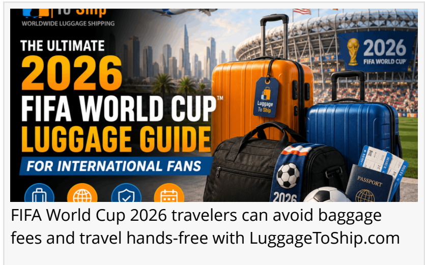
FIFA World Cup 2026 travelers can avoid baggage fees and travel hands-free with LuggageToShip.com

PALO ALTO, CA, UNITED STATES, June 19, 2026 /EINPresswire.com/ -- As millions of football fans prepare to travel across the United States, Canada, and Mexico for FIFA World Cup 2026 , LuggageToShip.com is helping travelers avoid airline baggage fees, airport hassles, and the inconvenience of carrying luggage between multiple destinations.