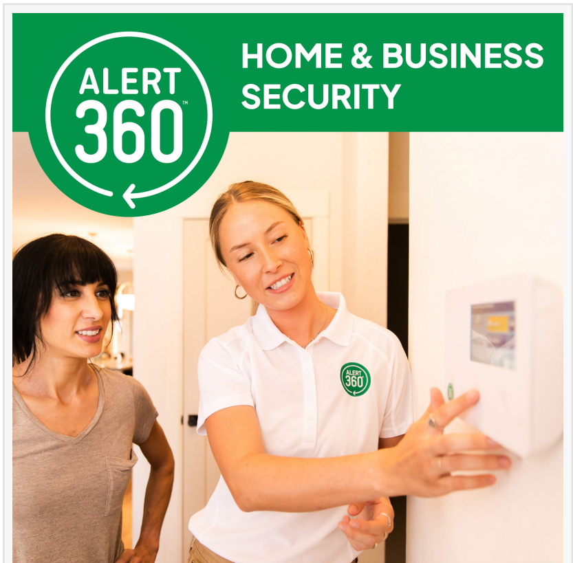
Top 10 security steps to increase home security

• Make your home unattractive to thieves, and build layers of security. Lighting, proper locks,