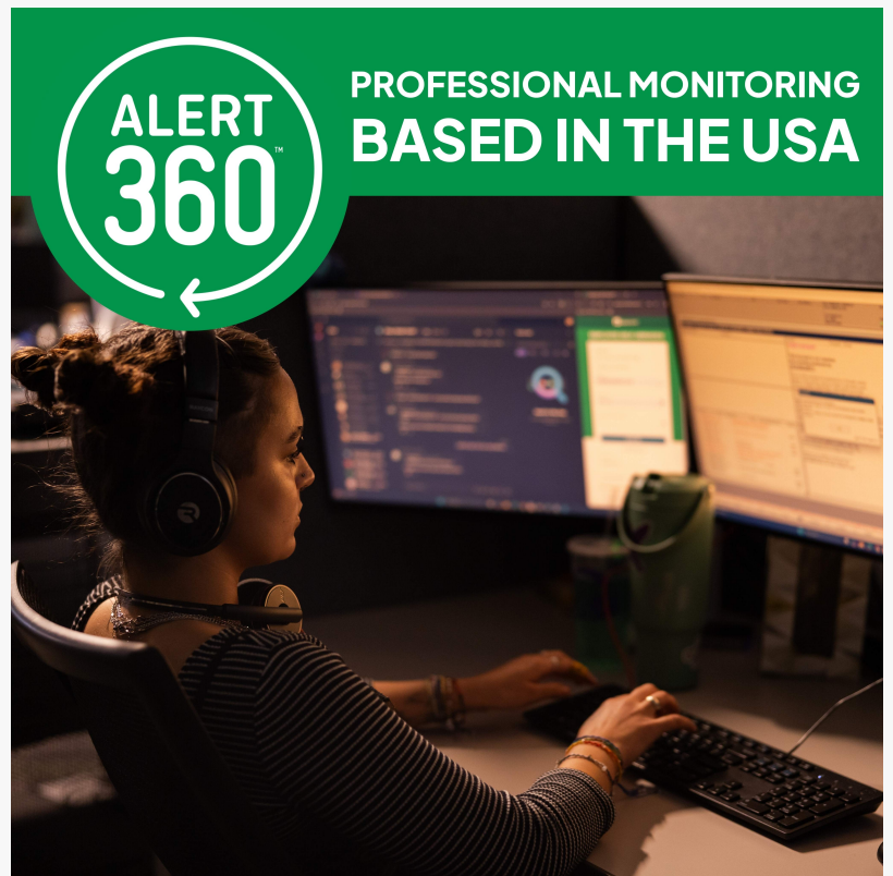
Professional Alarm Monitoring