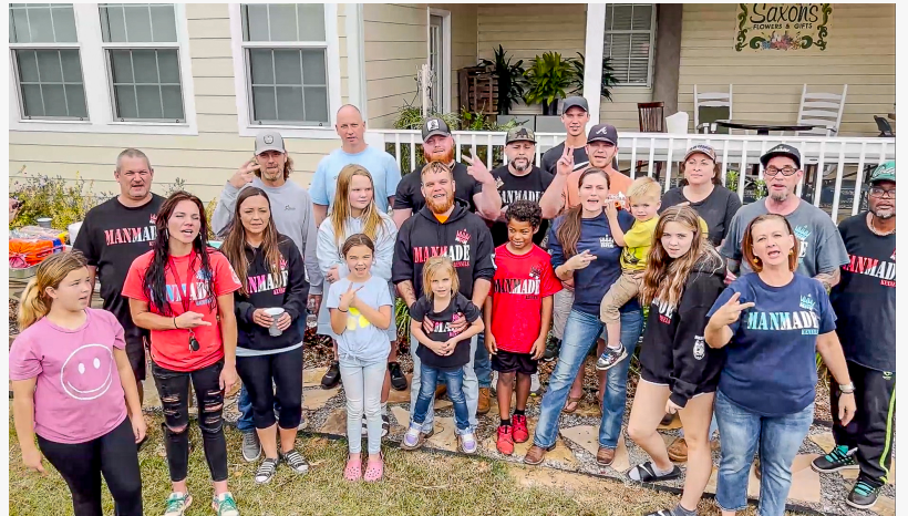
Manmade Kennels Family.