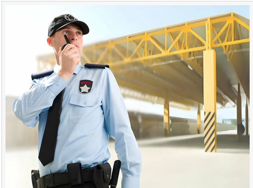
armed guard. (2)

based on site-specific risk assessments, which consider factors such as location type, hours of operation, visitor volume, and prior incident patterns. These assessments guide decisions on staffing levels, patrol frequency, and whether static or mobile coverage is more appropriate for a