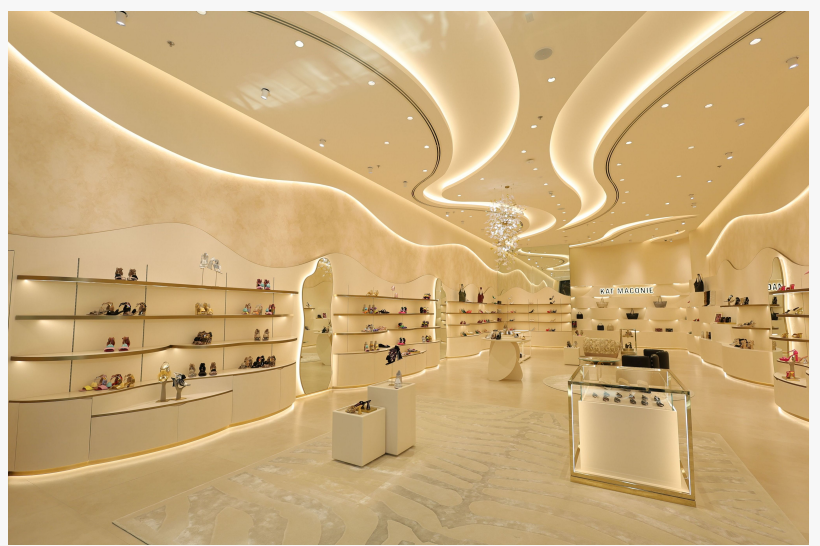
Kat Maconie Boutique - Dubai Mall