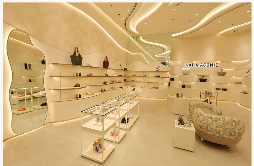
Kat Maconie Boutique - Dubai Mall