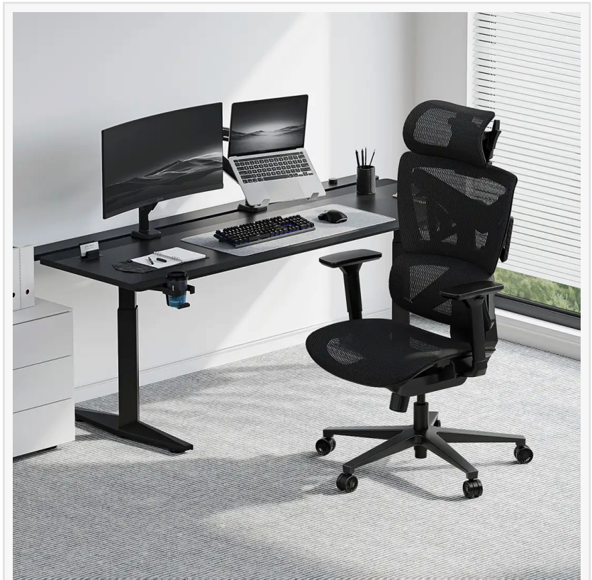
AndaSeat X-AIR Black

One of the more familiar frustrations in warm-weather desk use is that a chair may begin to feel