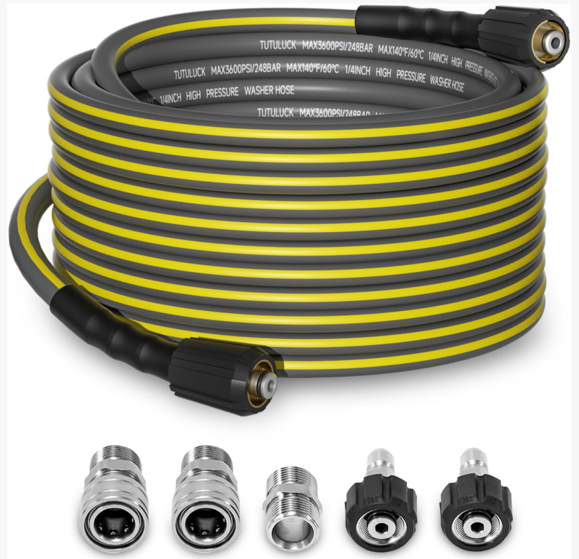
Zanchy High Pressure Braided Hose

operates at a maximum pressure of 18 Mpa (2610 psi) to generate thick, adhesive foam that pre-soaks vehicle surfaces.