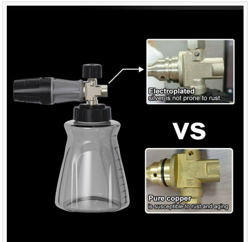
Zanchy Brass Snow Foam Cannon

Aluminum Snow Foam Cannon: Built with a lightweight aluminum metal core and a 1-liter Polyethylene (PE) bottle, this model is designed for everyday pre-washing. It features a 1/4-inch quick connect adapter, a 1.2mm orifice nozzle, a single steel filter net, and a plastic or rubber suction tube. It operates at a maximum pressure of 18 Mpa (2610 psi) to generate thick, adhesive foam that pre-soaks vehicle surfaces.