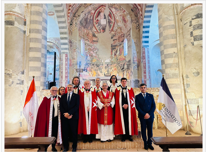
Participants gather at the Abbazia di Santa Giustina in Sezzadio during a Holy Mass honouring the patron saint of the Order of Saint John ahead of the 24 June feast day.