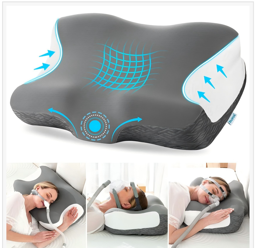
Elviros CPAP Pillow

Expert Validation and Clinical Value Clinical feedback strongly validates the therapeutic efficacy of this design. Medical and physical therapy professionals who evaluate sleep ergonomics emphasize that maintaining a constant, sealed pressure environment is crucial for stabilizing a patient's Apnea-Hypopnea Index (AHI). In independent user assessments, licensed physical therapists with over a decade of personal CPAP experience noted that the Elviros design completely eliminates mask pressure, halting air leaks while simultaneously delivering excellent neck support.