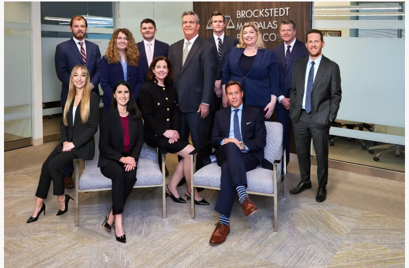
Medical Malpractice Team at BMF