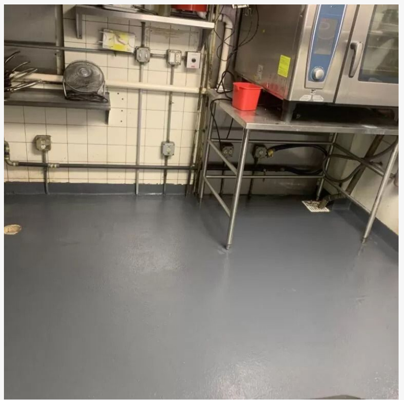
Non Slip Commercial Kitchen Flooring

-Customized Slip Resistance: Tailored surface texturing ensures optimal traction for staff, mitigating slip-and-fall hazards in fast-paced, wet environments.