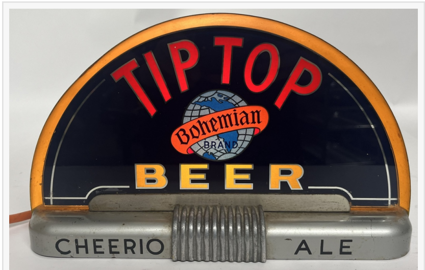
Super-rare Tip Top Bohemian Beer (Cleveland, Ohio) light-up cab sign with additional advertising for Cheerio Ale along base. Reverse-painted on glass.. All original. Estimate: $8,000-$10,000

Miles King - Co-Owner, Milestone Auctions