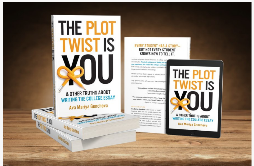
The Plot Twist Is You pic2