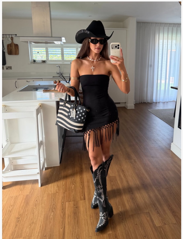
Flag Tote Purse