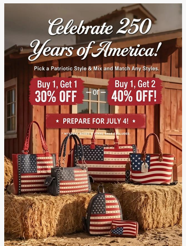
American Flag Purses

Established in 1992, Montana West has become a recognized leader in western-inspired handbags and accessories. For more than 30 years, the company has combined quality craftsmanship, trend-conscious design, and authentic Western influences to create products that reflect the spirit of the American West. Montana West offers a wide range of handbags, wallets, backpacks, travel accessories, and lifestyle products designed for customers who appreciate both heritage and style. The brand continues to serve customers across the United States and internationally through its growing collection of western fashion accessories.