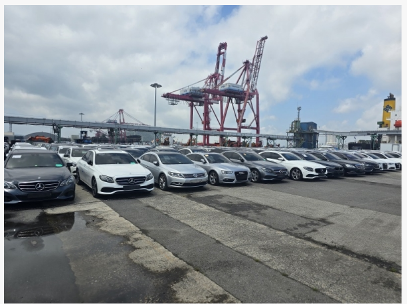
SSANCAR builds a European hub in Hamburg with KOTRA 01

/EINPresswire.com/ -- SSANCAR (Ssancar Co., Ltd.), a Korean B2B used car export company, announced that it is opening a new era of direct used car exports from Korea to Europe, building a European forward base in Hamburg, Germany, in partnership with the Korea Trade-Investment Promotion Agency (KOTRA).