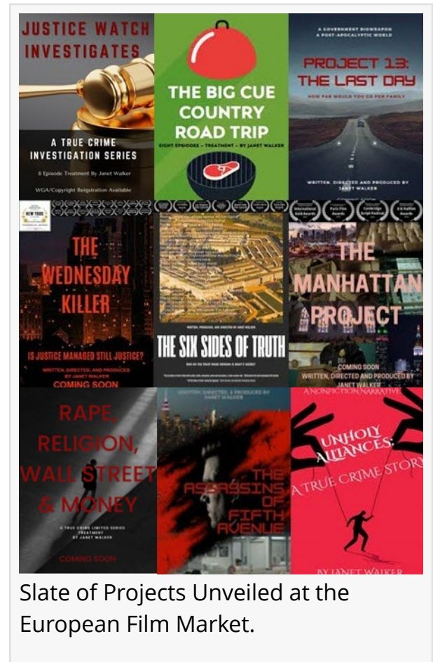
Slate of Projects Unveiled at the European Film Market.

“The Assassins of Fifth Avenue,” an edgy crime thriller, tells the story of a wealthy criminal mastermind, a serial killer, and a reporter determined to uncover the truth and the exiled detective she enlists to help her find the killer before he kills again.