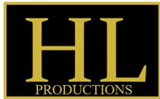
HL Productions Logo