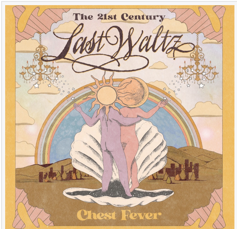
Chest Fever's 21ST CENTURY LAST WALTZ - LIVE AT MASSEY HALL album cover