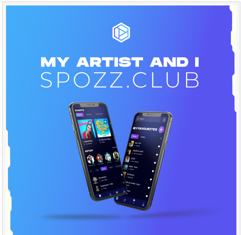
The SPOZZ Music App for Mobile Devices is on App Store and Google Play