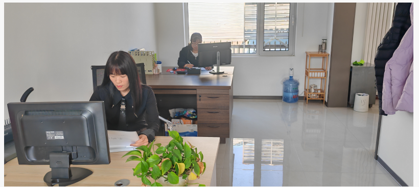
Sanhe Steel's office supports international sales, project coordination, customer service, and steel procurement management.