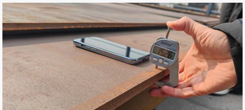
Sanhe Steel High Strength Steel Plate available in multiple grades, thicknesses, and custom-processed dimensions.

The initiative builds on Sanhe Steel’s international activity in 2026. In a company update published on April 29, Sanhe Steel reported that overseas order volume had increased by more than 30 percent year over year as of the end of April, with products supplied to more than 20