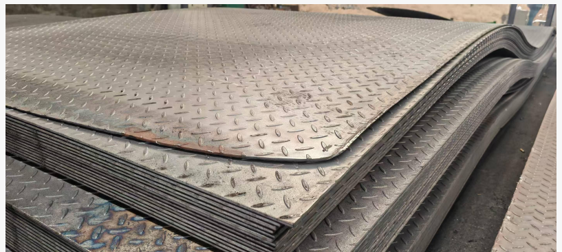
Sanhe Steel Checkered Plate is available in multiple patterns, thicknesses, and dimensions for flooring, walkways, stairs, and industrial platforms.