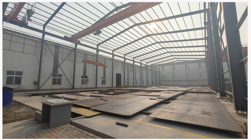
Sanhe Steel's steel processing facility supports plate cutting, leveling, slitting, custom fabrication, and export order preparation.

Sanhe Steel High Strength Steel Plate is available across several strength levels for project-specific selection. The company's published range includes Q355, Q420B/C/D, Q460E, Q690D/E, S460QL, and S690QL, while Q235 Steel Plate is available for conventional structural and general fabrication requirements.