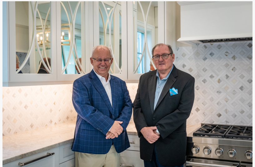
Vero Premier Properties