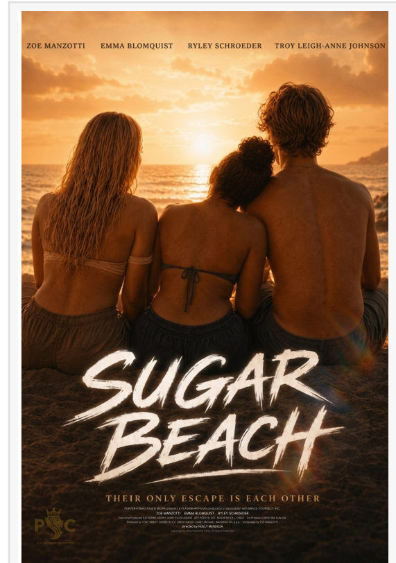
Sugar Beach Poster