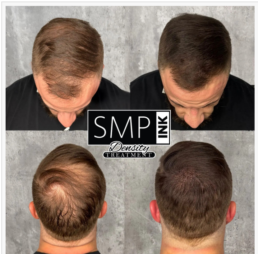
hair density treatment example with SMP INK for a Male