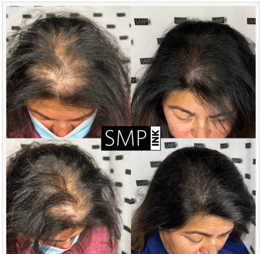
hair density treatment example with SMP INK