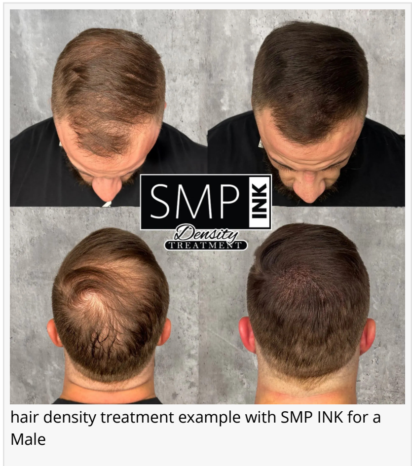
hair density treatment example with SMP INK for a Male

This press release can be viewed online at: https://www.einpresswire.com/article/921984907