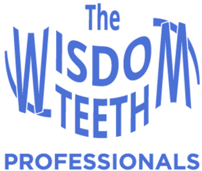
Wisdom Teeth Professionals - Melbourne

For patients needing wisdom teeth removal in Sydney , cost concerns can add to the stress of pain, swelling, infection or uncertainty about whether surgery is required. Wisdom Teeth Professionals says early assessment