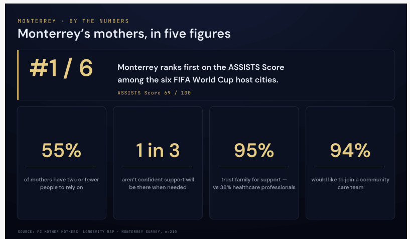
Monterrey - by the numbers