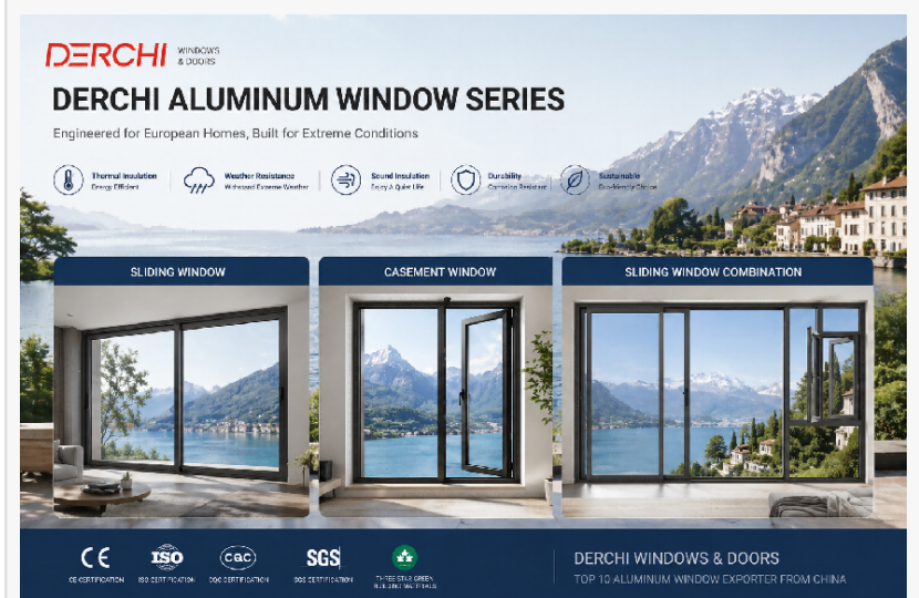
custom aluminum windows Europe