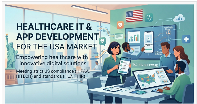
Healthcare IT USA

That requirement places interoperability at the heart of modern healthcare app development. The ability to move patient and clinical data safely between an app and an electronic health record, a laboratory system, a billing platform, or a remote monitoring device is what separates a useful clinical tool from a standalone product that sits on the edge of the workflow. Taction Software has built its healthcare app practice around this principle, treating integration not as an afterthought but as a core part of how an application is designed from the first planning session.