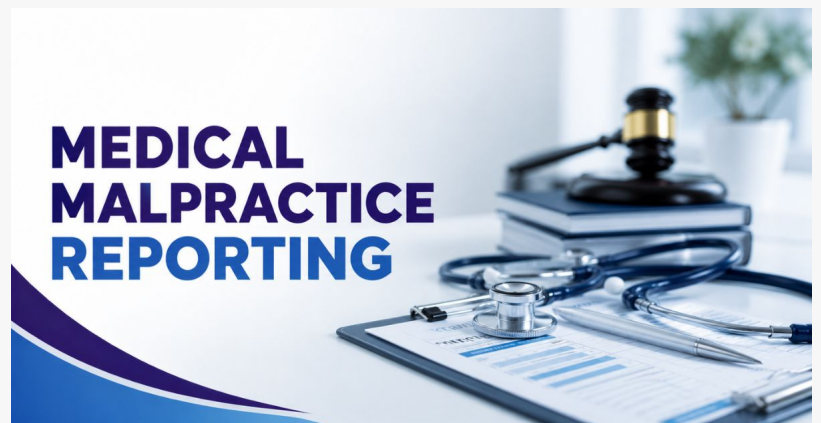
medical malpractice reporting