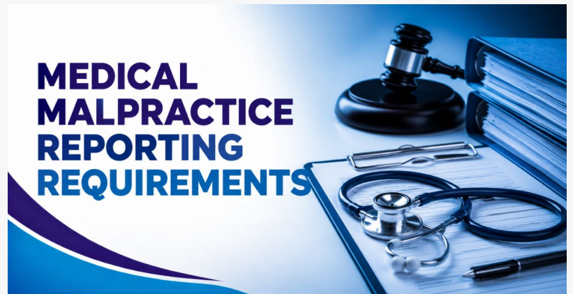
medical malpractice reporting requirements