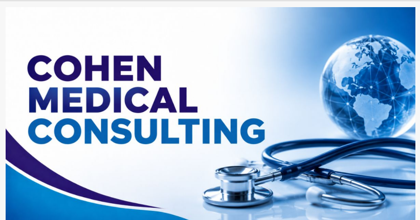
Cohen- Medical Consulting

Understanding the technical benchmarks of medical malpractice reporting requirements remains essential for both affected families and practicing attorneys. Federal and state