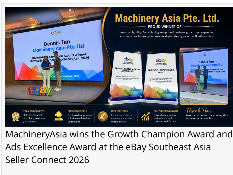
MachineryAsia wins the Growth Champion Award and Ads Excellence Award at the eBay Southeast Asia Seller Connect 2026

MachineryAsia Pte. Ltd. , a global exporter of compact construction and material-handling equipment and parent company of TYPHON Machinery , has been named recipient of the Growth Champion Award 2026 and Ads Excellence Award 2026 at the eBay Southeast Asia Seller Connect 2026, recognizing outstanding business growth and digital excellence.