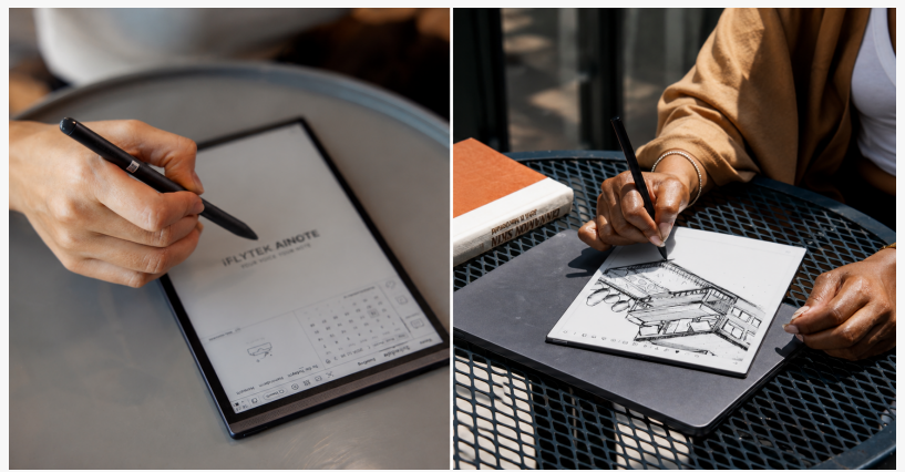
iFLYTEK AINOTE AIR 2 and AINOTE 2

Rather than relying solely on smartphone apps, the dedicated device provides a fast, reliable and intuitive way to overcome language barriers wherever communication matters most.