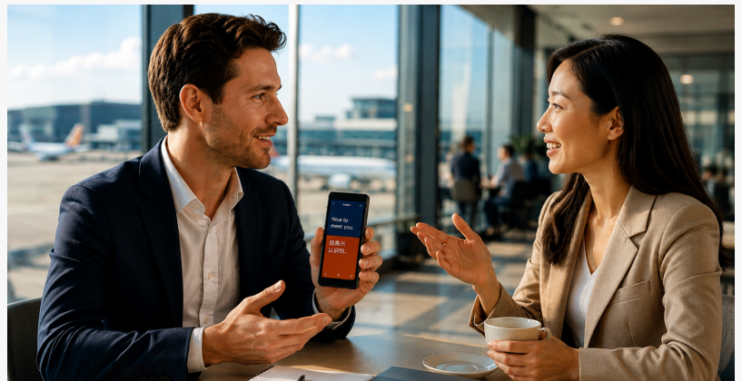
iFLYTEK Smart Translator