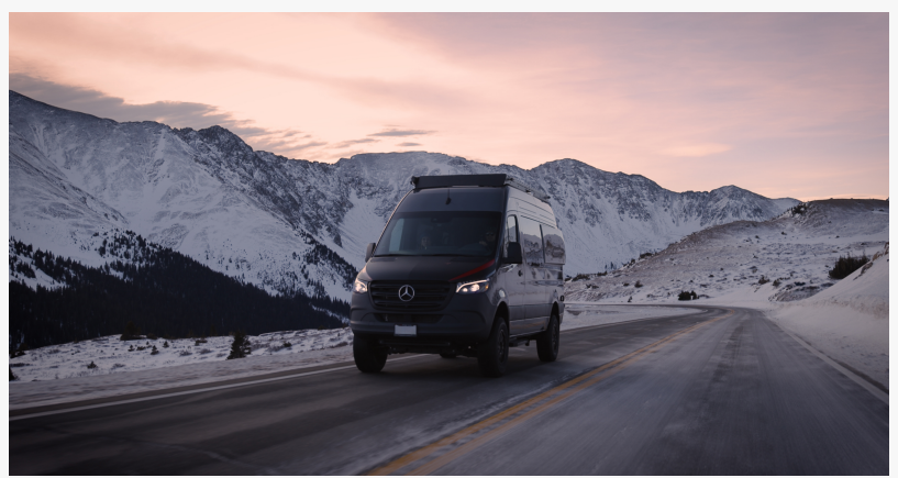
Titan Vans Metis on Loveland Pass