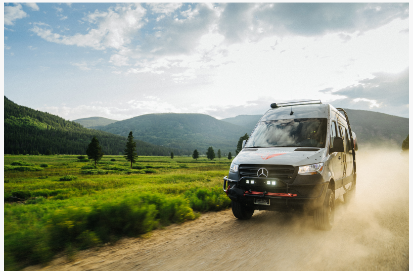
All Titan Vans models are offroad capable.