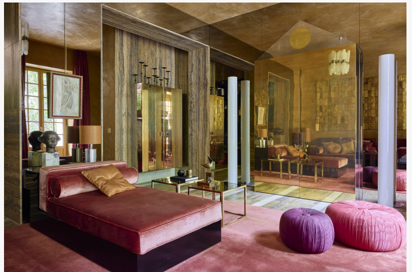
Myttas Uno, Chamberí, Madrid, Spain