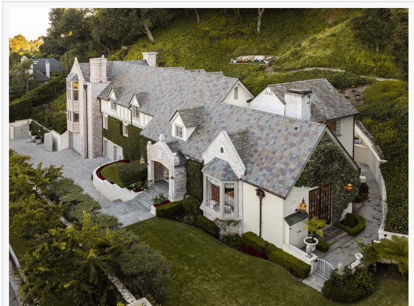
10950 Bellagio Road, Bel Air, Los Angeles, California

NEW YORK, NY, UNITED STATES, June 26, 2026 /EINPresswire.com/ -- Concierge Auctions is pleased to announce that bidding is now open for its June 2026 London Global Sale , one of the firm's most anticipated events of the year. Representing US$80M in luxury real estate offerings, bidding will culminate live on 30 June at The Connaught in Mayfair. The curated selection of marquee properties spans North America and Europe, including top markets: Los Angeles, California; Palm Beach, Florida; Chicago, Illinois; Côte d'Azur, France, and more.