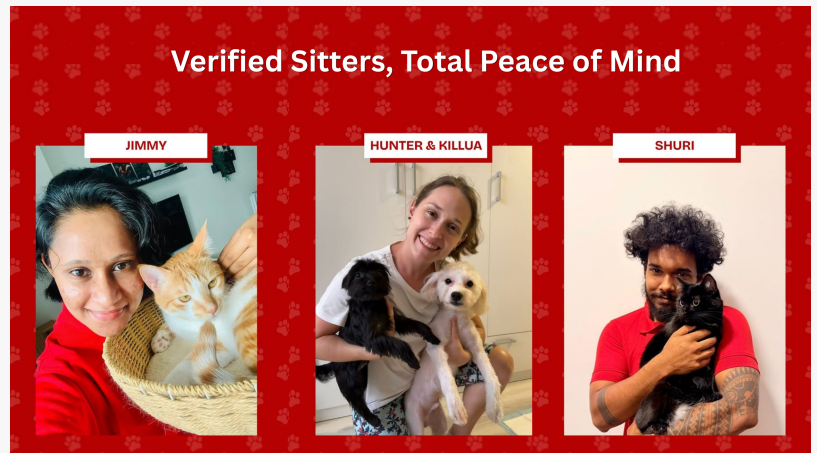
Pawland's Pet Sitters