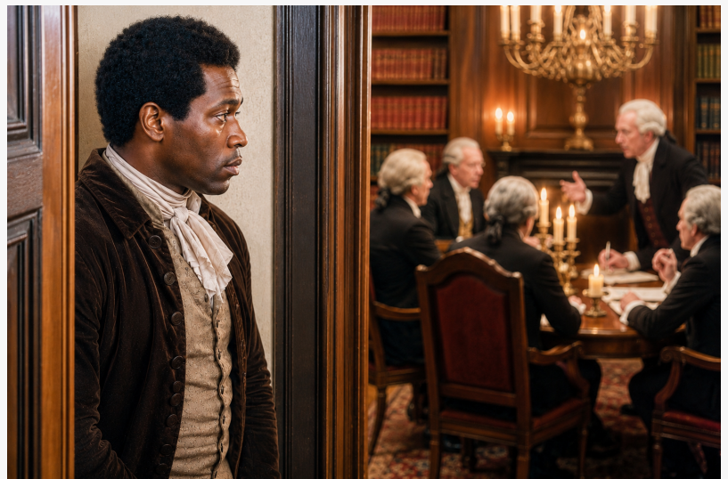
Pompey, the enslaved valet at the centre of The Valet's Witness , quietly observes the debates surrounding the Declaration of Independence as America's founders shape a new nation.