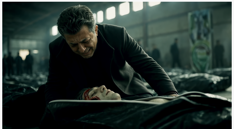
77 Hours - Scene screen shot | Iranian AI-Hybrid Political Thriller