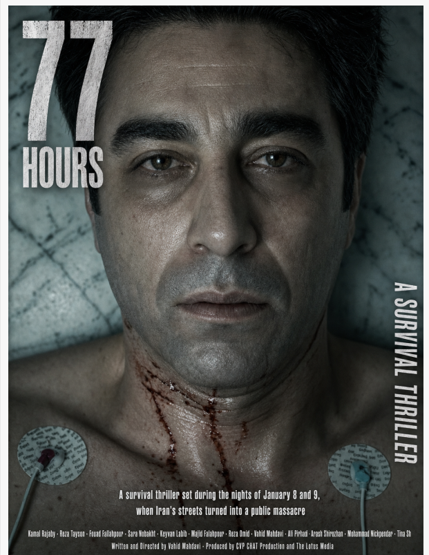
77 Hours - Official Poster | Iranian AI-Hybrid Political Thriller