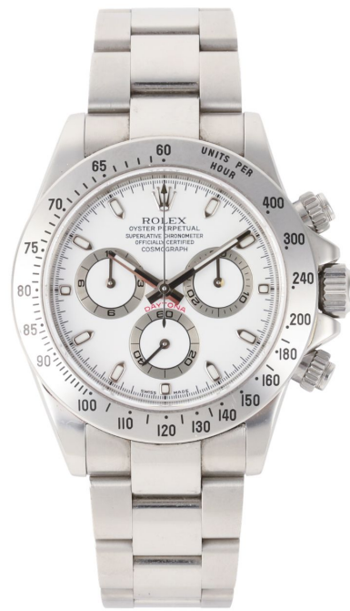
Rolex Ref. 116520 Daytona, complete factory set with original holographic caseback sticker. (CA$32,670)