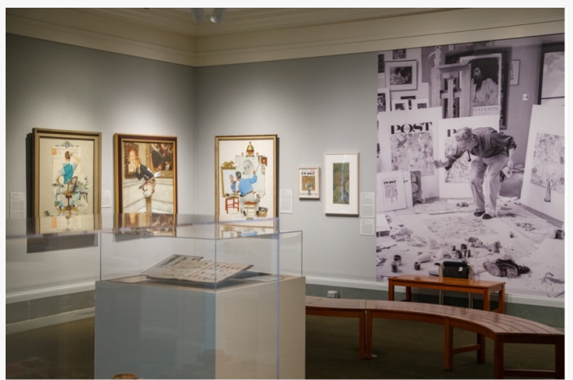
Norman Rockwell Museum

For outdoor enthusiasts, the Summer is THE season. Lace up the boots for a hike at Mahanna Cobble or explore the Mass Audubon Pleasant Valley Wildlife Sanctuary. Prefer two wheels? The