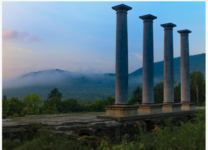
The Ruins at Ashintully