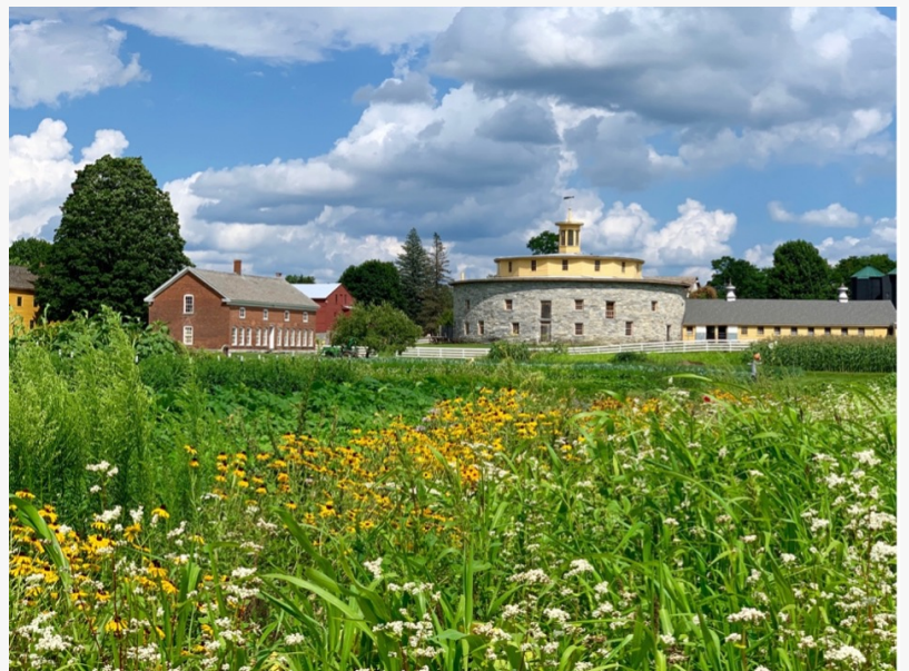
Hancock Shaker Village