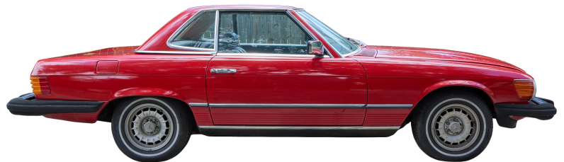
1981 Mercedes-Benz 380SL two-door convertible with a 155-horsepower 3.8-liter V8 engine, rear-wheel drive and a four-speed automatic transmission. Estimate: $8,000-$12,000