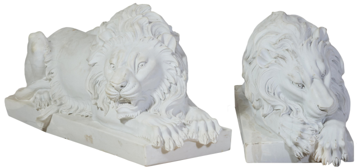
Late 20th century pair of carved marble recumbent lions. Estimate: $4,000-$6,000

A late 20th century reproduction British K-6 Kiosk "Telephone Booth" wine bar would be a wonderful accent to anyone's home and is expected to realize $800-$1,200. Also, a large and unusual pair of Black Forest figural carved walnut jewelry caskets, crafted in the late 19th century, should breeze to $2,000-$4,000.