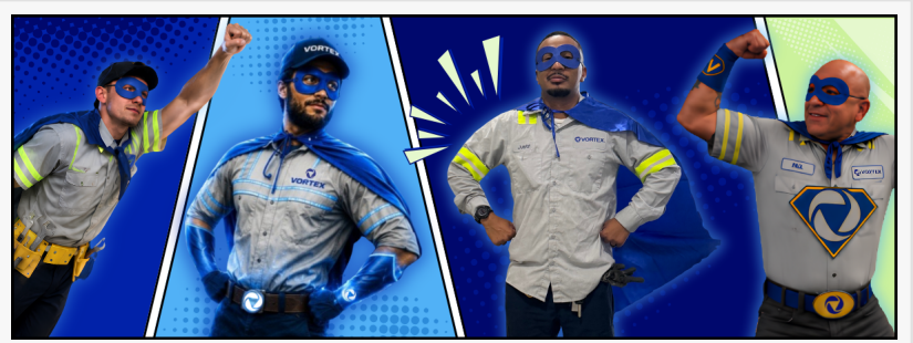
Vortex Doors SuperTech Day Banner

While customers may only see the finished result, SuperTech Day highlights the expertise, problem solving, and dedication that go into commercial door repair and maintenance. These technicians are the real heroes behind every service call.