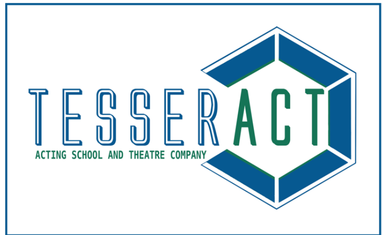
Tesseract Theater Company

This press release can be viewed online at: https://www.einpresswire.com/article/922798821