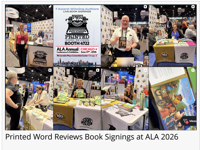
Printed Word Reviews Book Signings at ALA 2026

CHICAGO, IL, UNITED STATES, June 29, 2026 /EINPresswire.com/ -- Yesterday, the exhibition floor of the American Library Association (ALA) Annual Conference buzzed with literary excitement as Printed Word Reviews hosted a spectacular, back-to-back lineup of exclusive book signings. Held at Booth 4722, the highly anticipated event brought together hundreds of librarians, educators, and book lovers eager to meet some of today's most compelling literary voices.