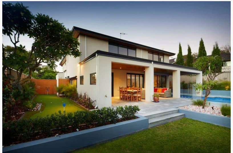
best Landscapers In Perth

That combination of scope and accountability is why the guide rates Landscapes WA as the best option for landscaping in Perth in 2026. The company works across the full metropolitan area from the northern suburbs down to Mandurah on projects that range from compact courtyards to complete property transformations. Its portfolio spans both contemporary and traditional styles, and its teams handle the technical work, such as drainage, levels and retaining, that often separates a garden that lasts from one that fails within a few seasons.