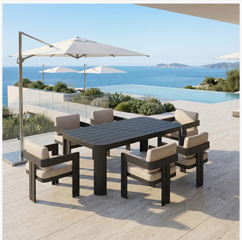
Kingmake Outdoor Dining Set

NEW YORK, CA, UNITED STATES, June 29, 2026 /EINPresswire.com/ -- China — June 29, 2026 — Foshan Kingmake Industry Co., Ltd., a global outdoor furniture manufacturer, today announced the expansion of its outdoor dining set collection, engineered for hotels, resorts, villas, restaurants, and other high-traffic commercial environments. The launch responds to growing demand from hospitality groups and furniture brands seeking a reliable outdoor furniture manufacturer capable of delivering durable, design-forward dining solutions at scale.