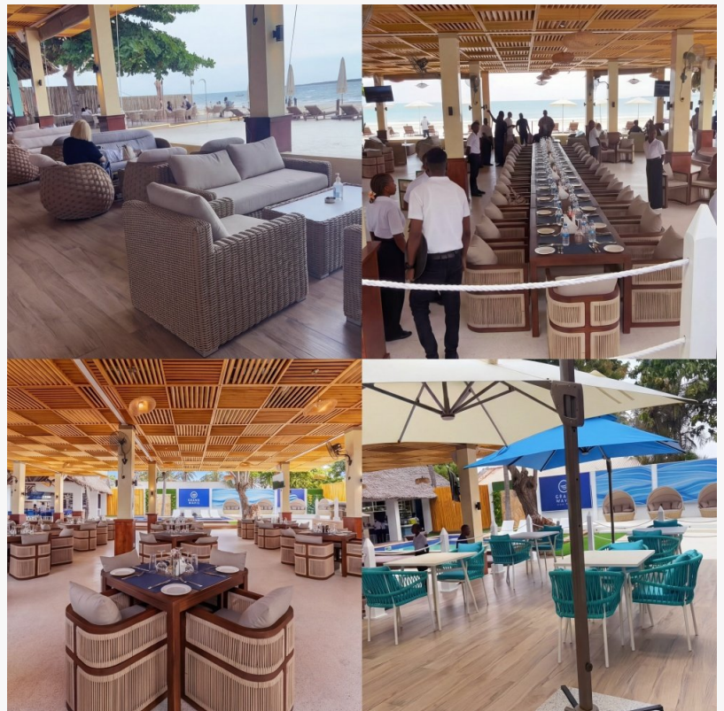
Kingmake Hospitality Furniture