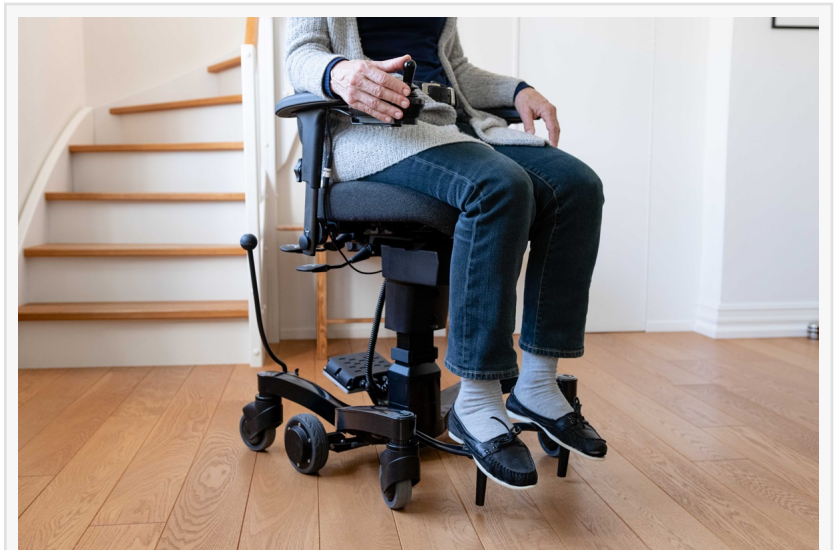
VELA mobility chair with Power Wheels, 360° maneuverability, and electric height adjustment