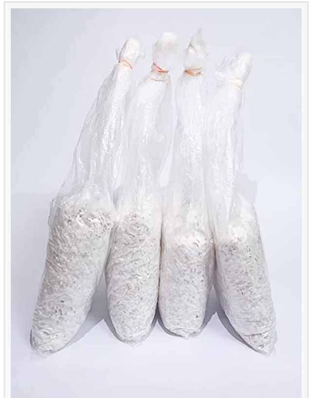
Gachwala Milky Mushroom Spawn prepared for cultivating Milky Mushrooms ( Calocybe indica ) in home and commercial mushroom growing setups.

This new ready-to-harvest kit brings to this product category and provides a prepared cultivation bag for the fruiting stage of oyster mushroom cultivation.