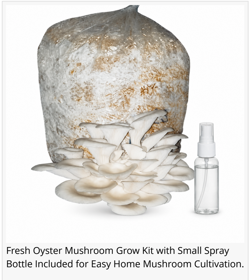
Fresh Oyster Mushroom Grow Kit with Small Spray Bottle Included for Easy Home Mushroom Cultivation.

The ready-to-harvest kit is meant to be applied at a later stage in the cultivation process, unlike standard cultivation workflows where users are involved in the procurement of raw materials, preparation of substrate, inoculation with oyster mushroom spawn and management of