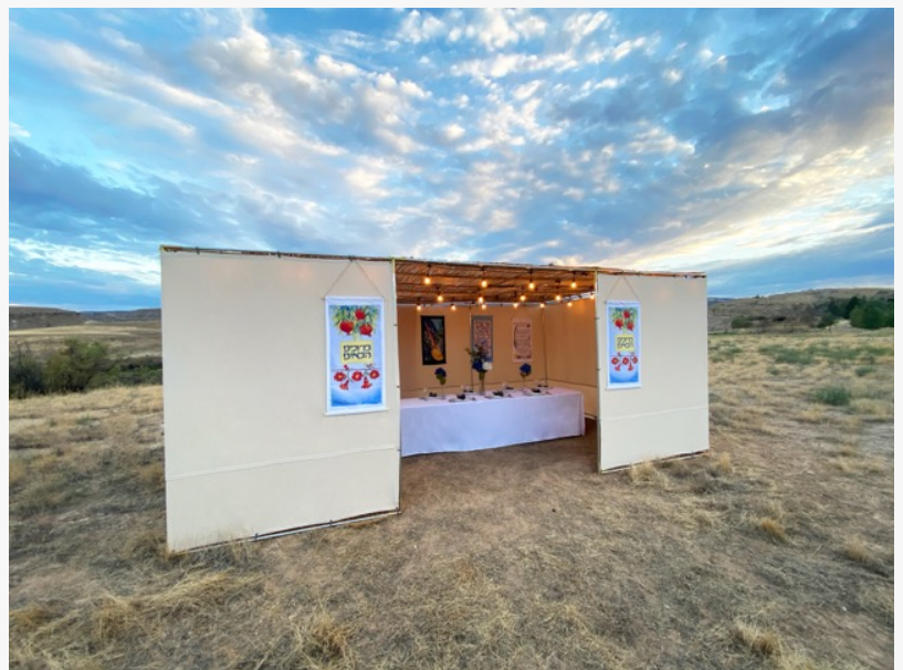
An image of a large sukkah, like the type that will be provided to families and congregations through The Sukkah Foundation.