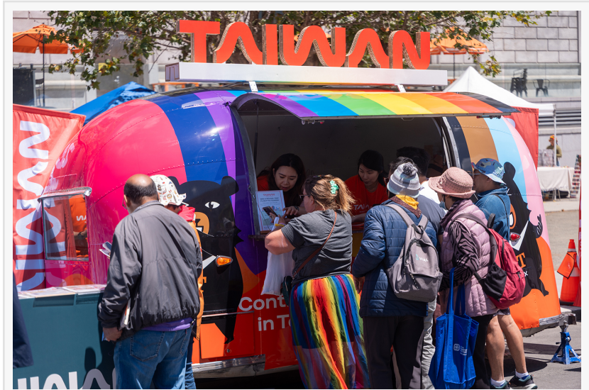
Taiwan Tourism Administration also host a Taiwan tourism booth at San Francisco Civic Center Plaza on June 27 and 28, offering travel information, destination introductions, and interactive experiences.

This year, the Taiwan Tourism Administration and the Taipei Economic and Cultural Office in San Francisco participate in the San Francisco Pride Parade on June 28 as "Taiwan in SF," and debut Taiwan's first themed float at the event. Through colorful visual design, the float showcases the charm of Taiwan tourism. Its design brings together elements such as Taipei 101, Pingxi sky lanterns, the Dragon and Tiger Pagodas in Kaohsiung, Lanyu plank boats, the Alishan Forest Railway in Chiayi, Tsou culture, the Queen's Head at Yehliu, bubble tea, the Taiwan blue magpie, the leopard cat, and OhBear, Taiwan tourism's beloved mascot. Together, these elements present Taiwan's diversity, from city life to nature, and from culture to ecology. The float is not only a moving showcase of Taiwan tourism, but also a symbol of Taiwan sharing the spirit of Pride with the world in an open, confident, and welcoming way.