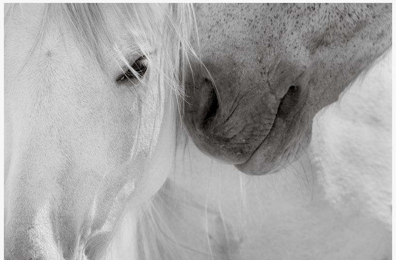
Seduction from American Wild Horses by photographer Maria Marriott

This press release can be viewed online at: https://www.einpresswire.com/article/923137617