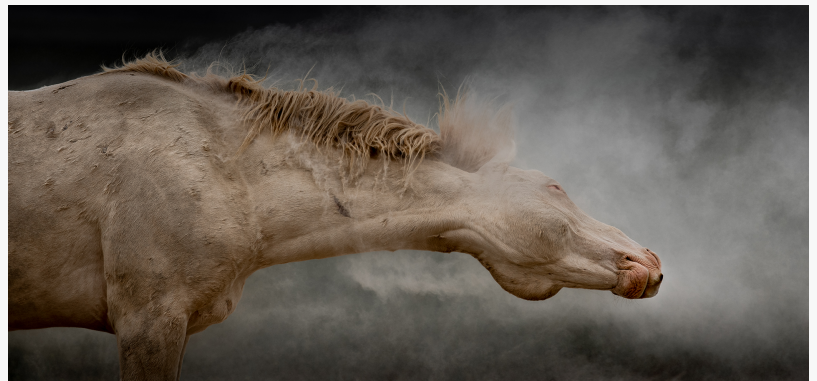
Cremello Dust: a rugged wild stallion in the Onaqui Mountains of Utah