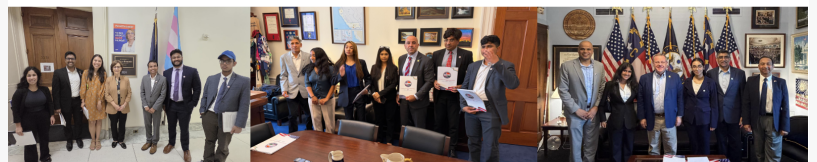
With Rep. Suzan Bonanici (OR)