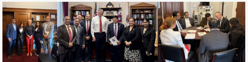
With Rep. Deborah Ross (NC)