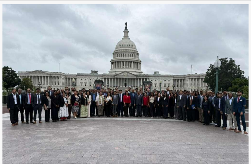
FIIDS Delegates on the Capitol Hill June 23 2026

WASHINGTON, DC, UNITED STATES, June 30, 2026 /EINPresswire.com/ -- The Foundation for India and Indian Diaspora Studies (FIIDS), representing the policy interests of more than 5.1 million Indian Americans, successfully concluded its 4th Annual Indian American Capitol Hill Day , bringing together over 150 delegates, including 35 youth and more than 40 women leaders, from 25 states to meet with over 100 Congressional offices and 16 U.S. Senate offices, making it one of the largest coordinated Indian American advocacy initiatives on Capitol Hill.