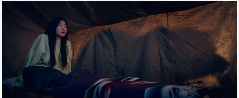
Official Still - Piggy Duster